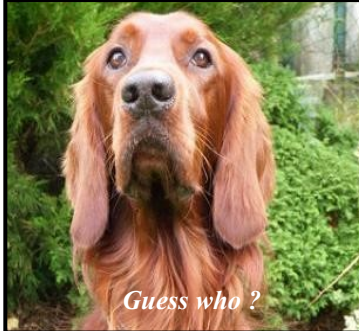
Guess who ?